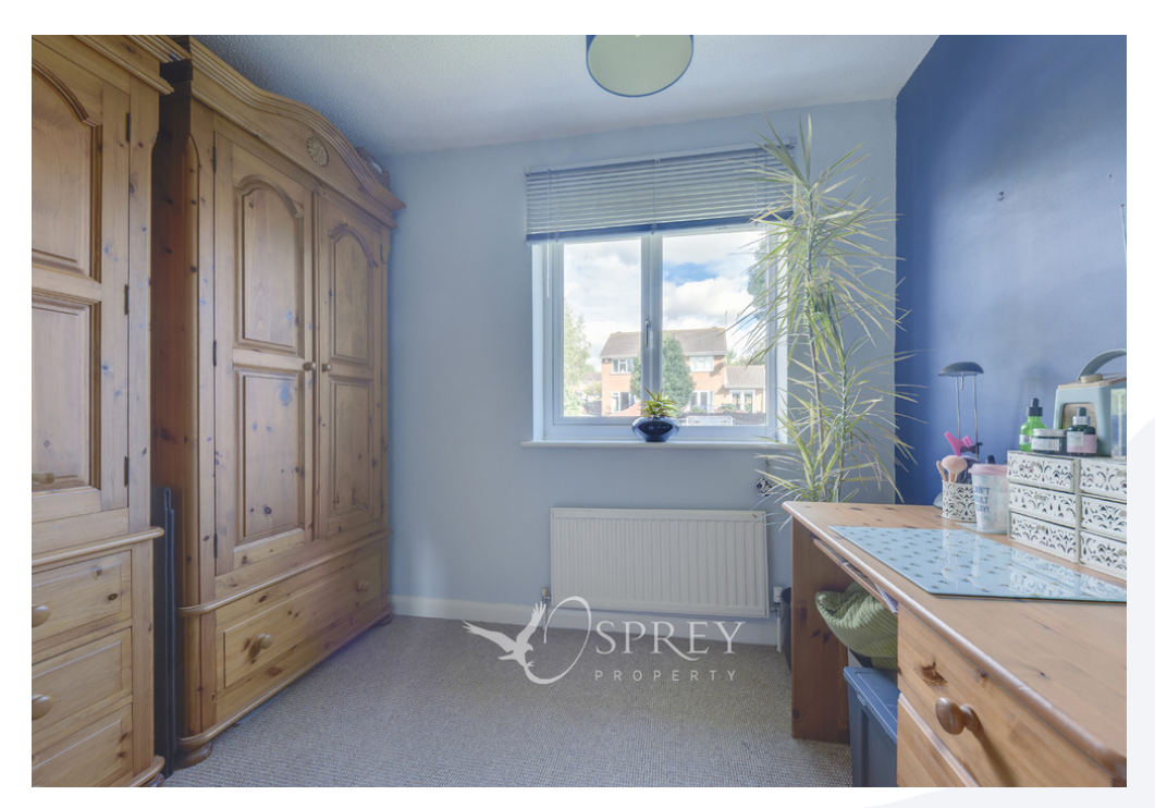
Tenure: Freehold All mains' services Council Tax Band: D EPC Rating To Follow

Melton Mowbray is a thriving market town offering excellent local shopping and schooling facilities with the added benefit of being within easy commuting distance of the surrounding centres of Leicester, Nottingham, Loughborough, Grantham, Oakham & Stamford. Superb private schooling is available at nearby Oakham in addition to the Loughborough Endowed Schools, Ratcliffe College and Leicester Grammar School. The town is situated on the Leicester/Peterborough/Stansted railway with an excellent intercity service to London available from both Grantham and Leicester (approximately 1 hour).