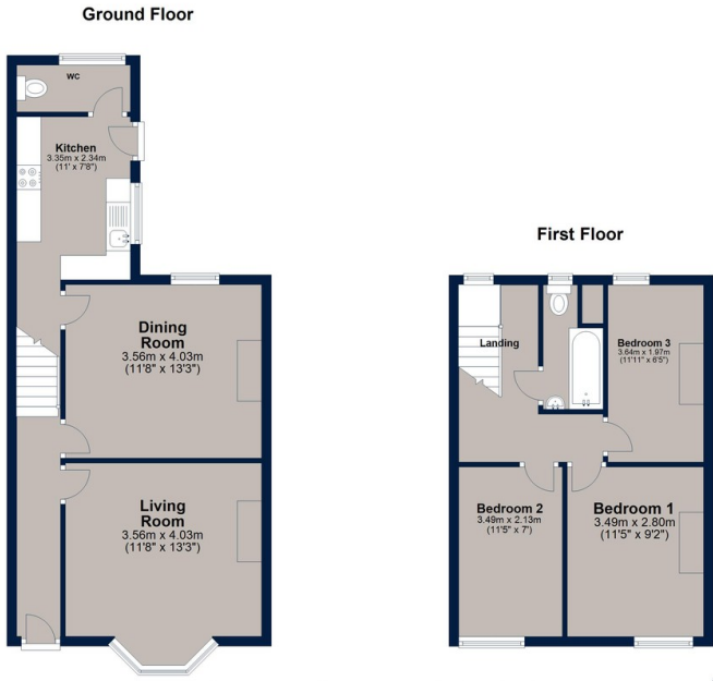
Total area: approx. 83.5 sq. metres (898.3 sq. feet) Plan is for illustration purposes only and may not be representative of the property. Plan is not to scale. Plan produced by M-Photo Plan produced using PlanUp.