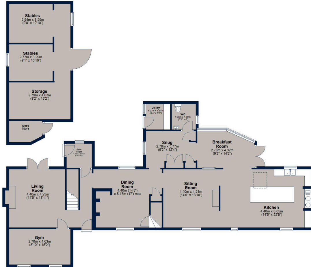
Ground Floor Approx. 191.8 sq. metres (2064.5 sq. feet)