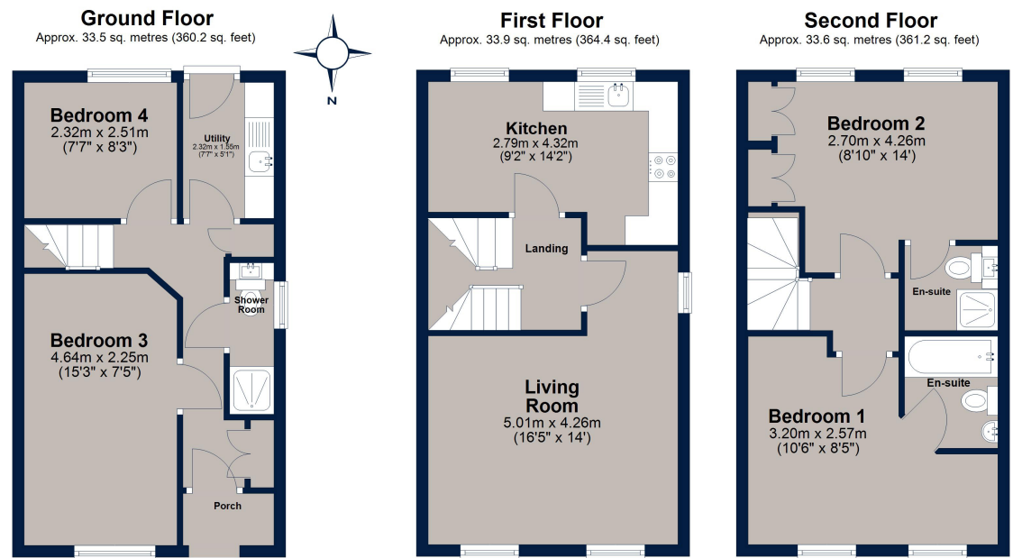
Total area: approx. 100.9 sq. metres (1085.8 sq. feet) Plan is for illustration purposes only and may not be representative of the property. Plan is not to scale. Plan produced by M-Photo. www.m-photo.pro Plan produced using PlanUp.