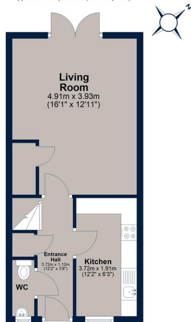
Ground Floor Approx. 34.3 sq. metres (369.2 sq. feet)