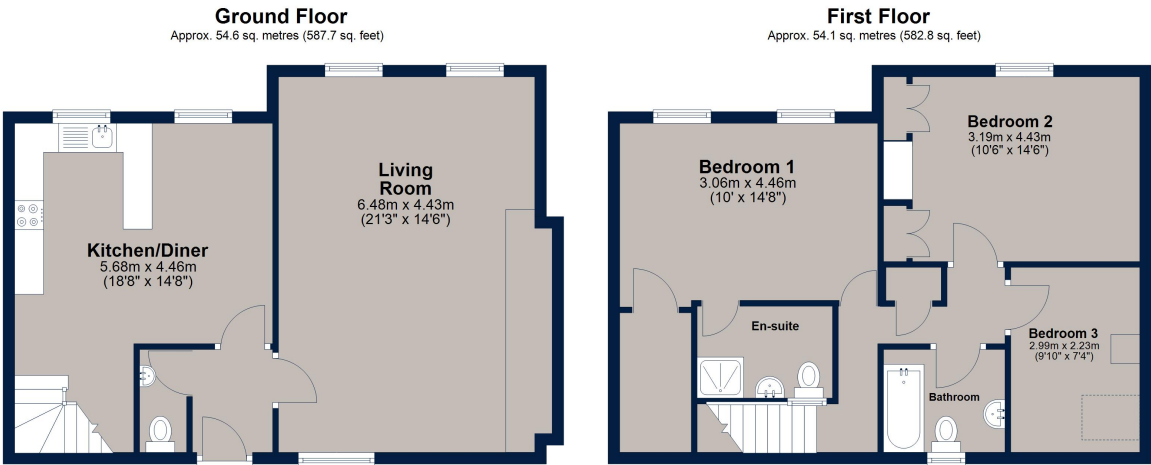
Total area: approx. 108.7 sq. metres (1170.5 sq. feet) This floor plan is for illustrative purposes only and is not to scale. All measurements, doors, windows, rooms and other items are approximate and should not be relied upon for any purpose. Plan produced using PlanUp.

Oakham is a highly popular market town, offering a range of amenities and services including restaurants, shops, bars, doctor's surgery, hospital and both primary/secondary schooling. There is a bus station providing regular services around the town and through to neighbouring villages and towns, as well as a train station with direct links to further towns and cities.