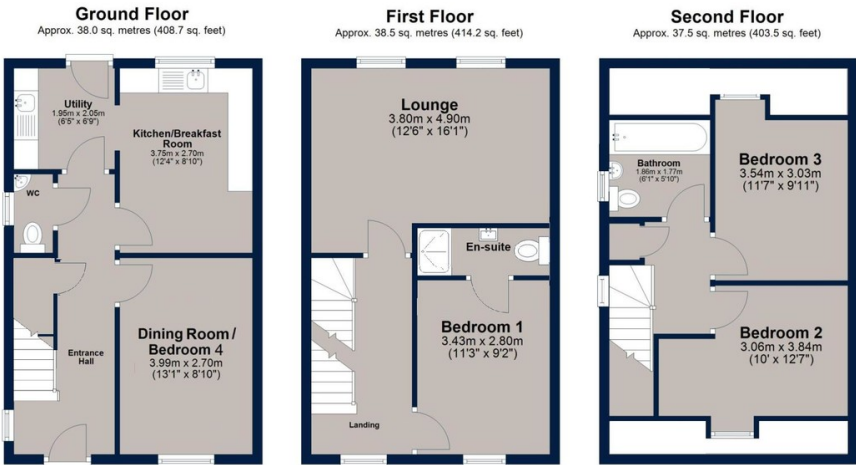
Total area: approx. 113.9 sq. metres (1226.4 sq. feet) This floor plan is for illustrative purposes only and is not to scale. All measurements, doors, windows, rooms and other items are approximate and should not be relied upon for any purpose. Plan produced using PlanUp.

A spacious three-storey townhouse in a quiet cul-de-sac, offering three double bedrooms, en suite to principal, large living room, kitchen with utility, and allocated parking for two. Well located for schools, parks and Melton Mowbray station. A flexible, well-balanced home.