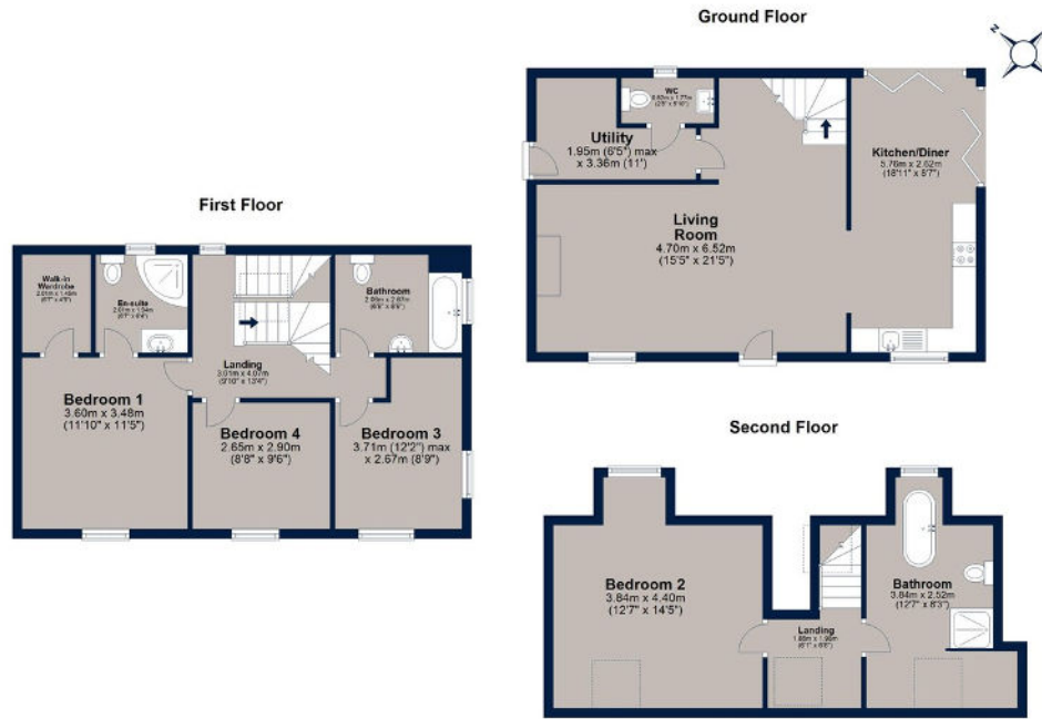
Total area: approx. 142.9 sq. metres (1538.3 sq. feet) Plan is for illustration purposes only and may not be representative of the property. Plan is not to scale. Plan produced by M-Photo Plan produced using PlanUp.