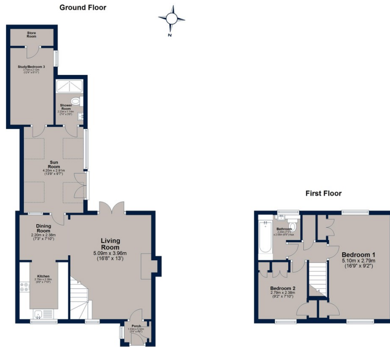
Total area: approx. 92.9 sq. metres (1000.4 sq. feet) Plan is for illustration purposes only and may not be representative of the property. Plan is not to scale. Plan produced by M-Photo Plan produced using PlanUp.